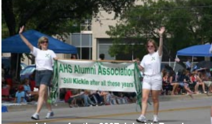
Join us for the 2007 July 4th Parade. All Alumni welcome to a walk and ride.