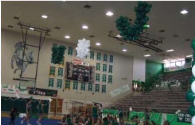
Early in the day, the Colt Cheerleaders go all out in decorating the gym for the pep rally.