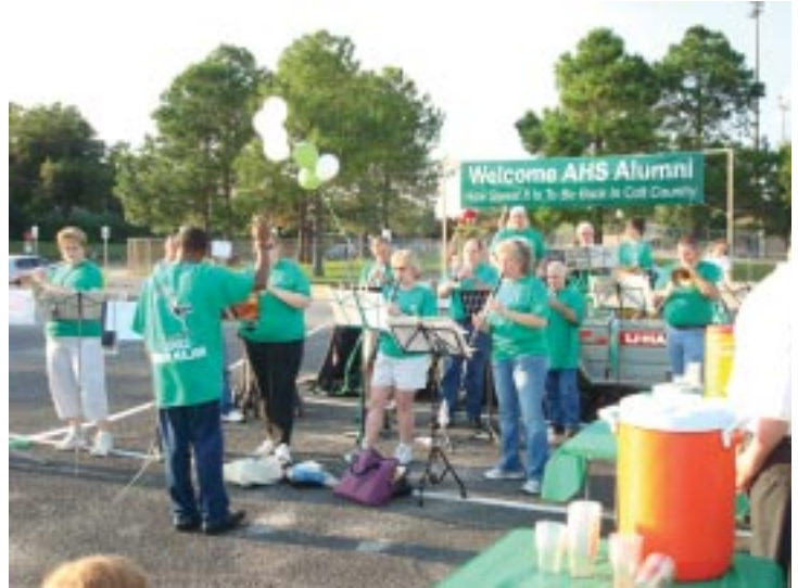
The Alumni Band enlivens the parking lot with traditional Colt songs.