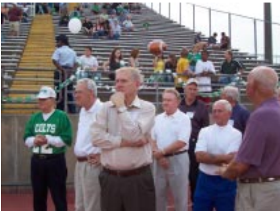
Former Colt football players watching the introduction of the honorees.