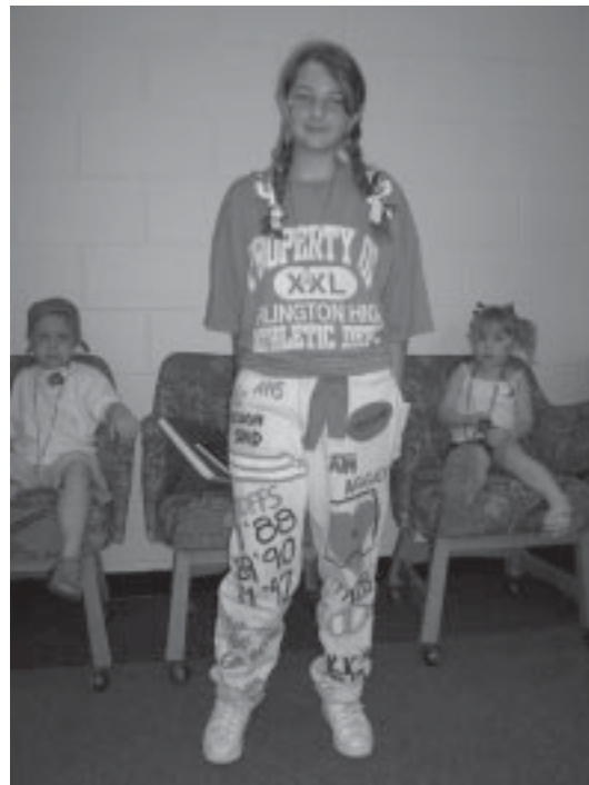
A young Colt fan models her mom's spirit pants from days gone by. If you know her and her mom, please, send their names (and grad years) to cathybbrown@sbcglobal.net .