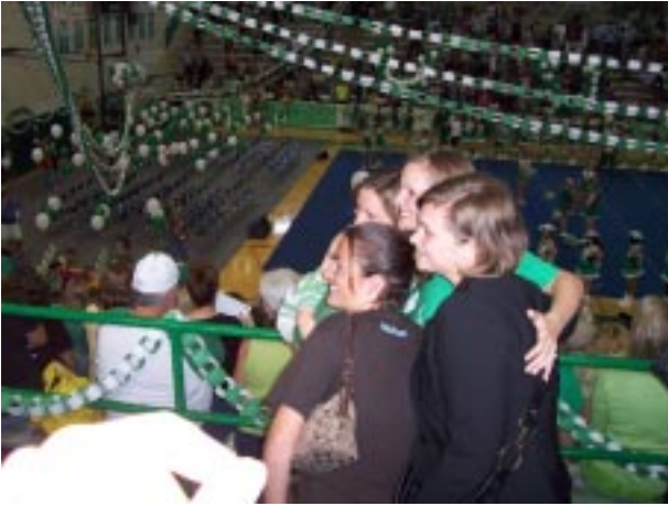
Class of 1996 ladies back in the gym for the pep rally.