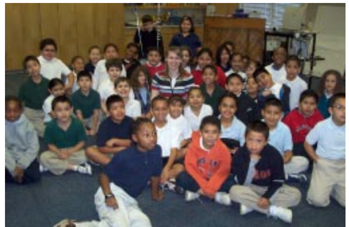
Second grade music students at Corinne Crow Elementary surround their grant winning teacher.