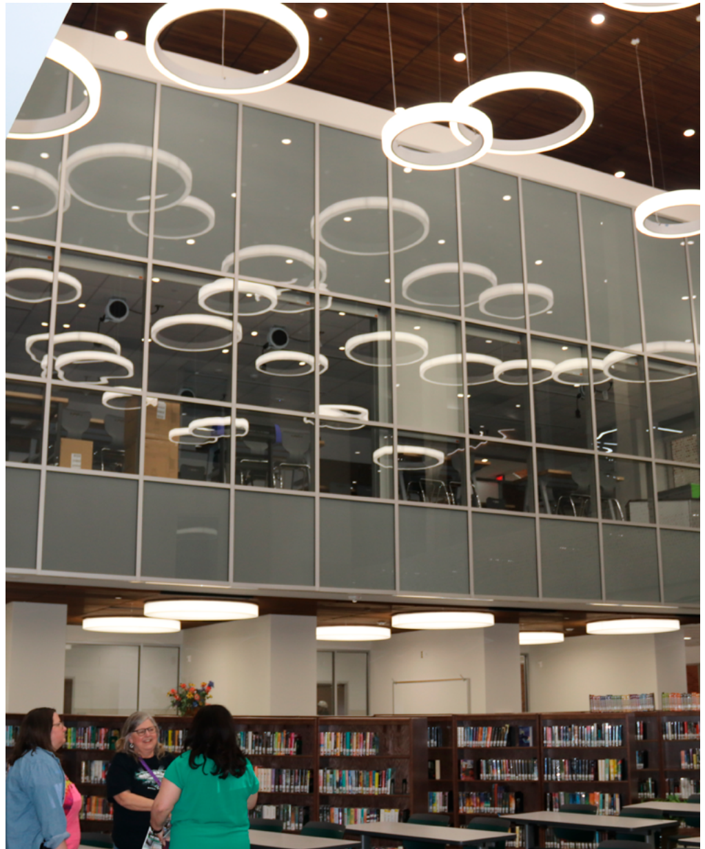
The open concept library, with its futuristic lighting, is the cornerstone for The Cube.